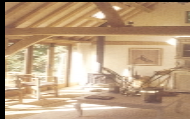
Make the most of your space