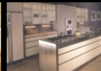
Rejuvenating your kitchen