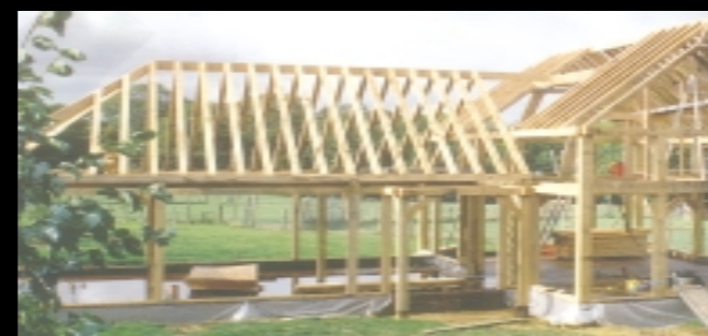
Building on a solid foundation