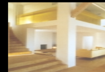
A fresh approach to modern interiors