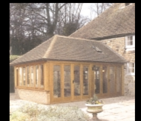
Classic extension design

We provide a professional, friendly service for all.